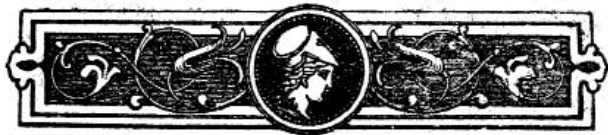
Ornament is from Domestic Cookery , Christchurch, 1895.

Was Colonial Goose a New Zealand invention and a genuine "new" dish? In name only perhaps, although the Australian stuffed black swan could at present claim precedence. It seems more likely that the shaped Colonial Goose has its roots in the north of England and Scotland, is a variant of Northumbrian Duck, and is, like the colonists themselves, almost certainly a transplant.