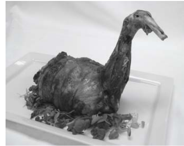
Colonial Goose. Photograph by Bill Bryce, 2011.